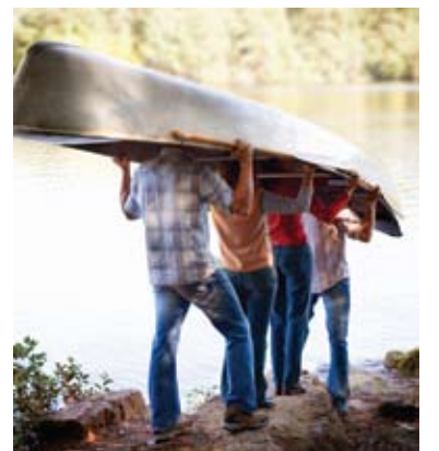
Canoe with friends on the Flint River