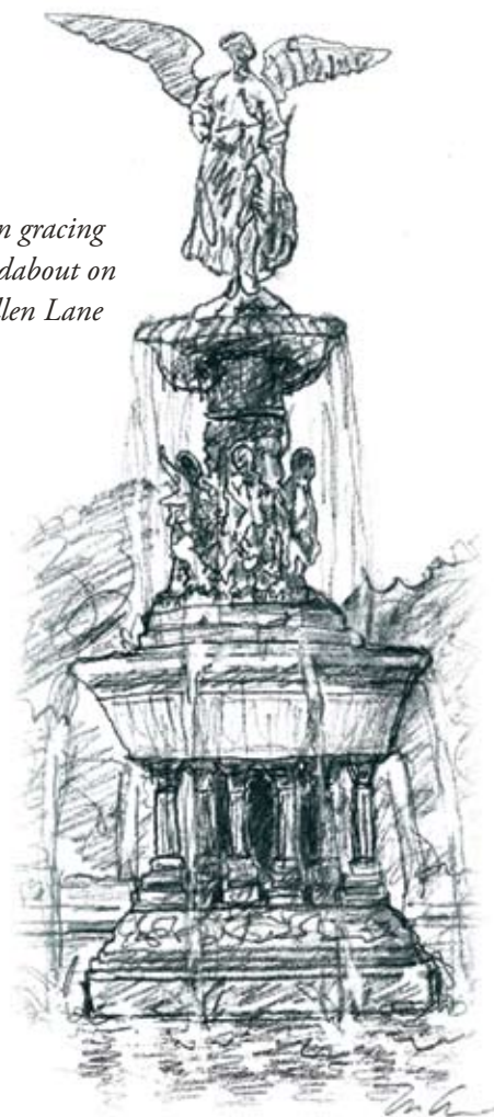
fountain gracing the roundabout on McMullen Lane

For the golfer... The Robert Trent Jones Golf Course is just 5 minutes from McMullen Cove