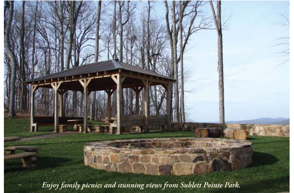
Enjoy family picnics and stunning views from Sublett Pointe Park.