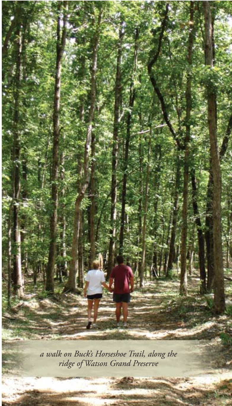
a walk on Buck's Horseshoe Trail, along the ridge of Watson Grand Preserve

The Tony Wilmer Trail System – an extensive network of over 20 miles of interconnected hiking, walking, and biking trails providing environments for both fitness and pleasure