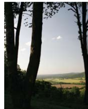
The view from Sublett Pointe Park at dusk

Leading the way in each community's design is the preservation and irreplaceable beauty of its natural environment...nature trails, mountain views, waterfalls, wildlife, and tranquil lakes. By building your home in such a magnificent place, you will have the use of fifteen hundred acres beyond your own homesite.